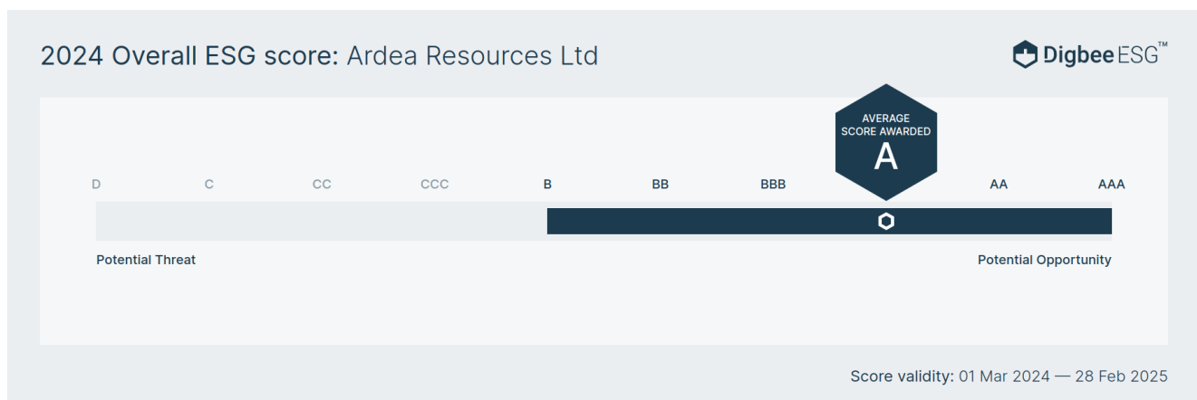
Figure 1: A graphic representation of Ardea's overall ESG risks and opportunities assessed by Digbee ESG.

Ardea notes that a commitment to ESG will continue as the Company advances the Kalgoorlie Nickel Project.