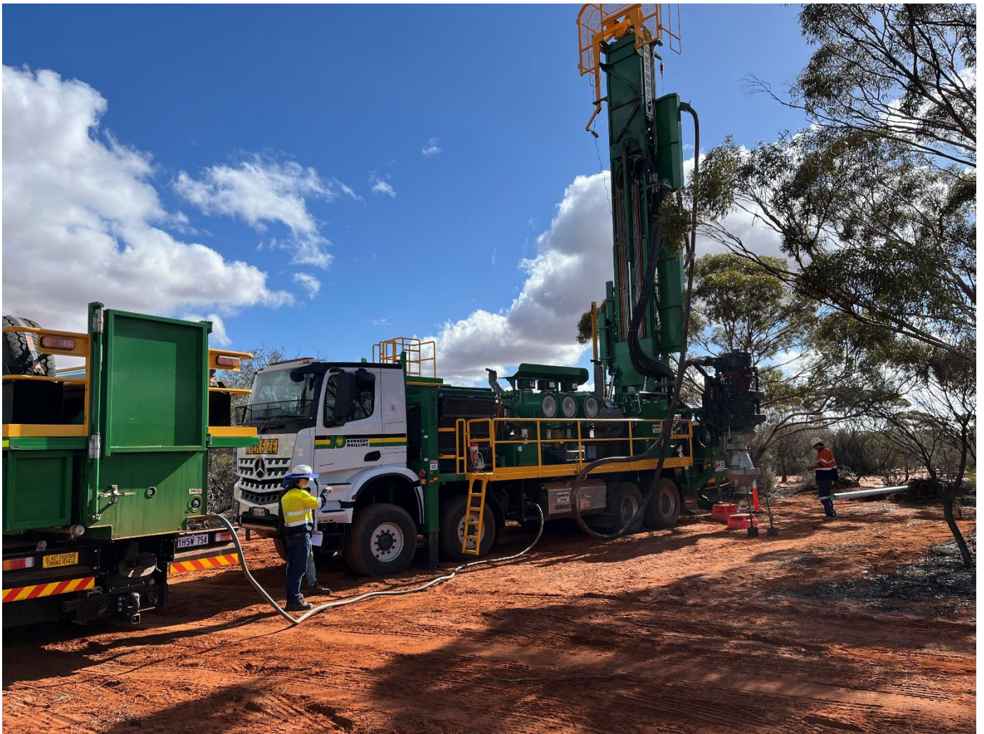
Figure 1. Kennedy RC drill rig 6, drilling on the first hole of the program at the northern end of the Big Four nickel-cobalt deposit.

This announcement is authorised for release by the Board of Ardea Resources Limited.