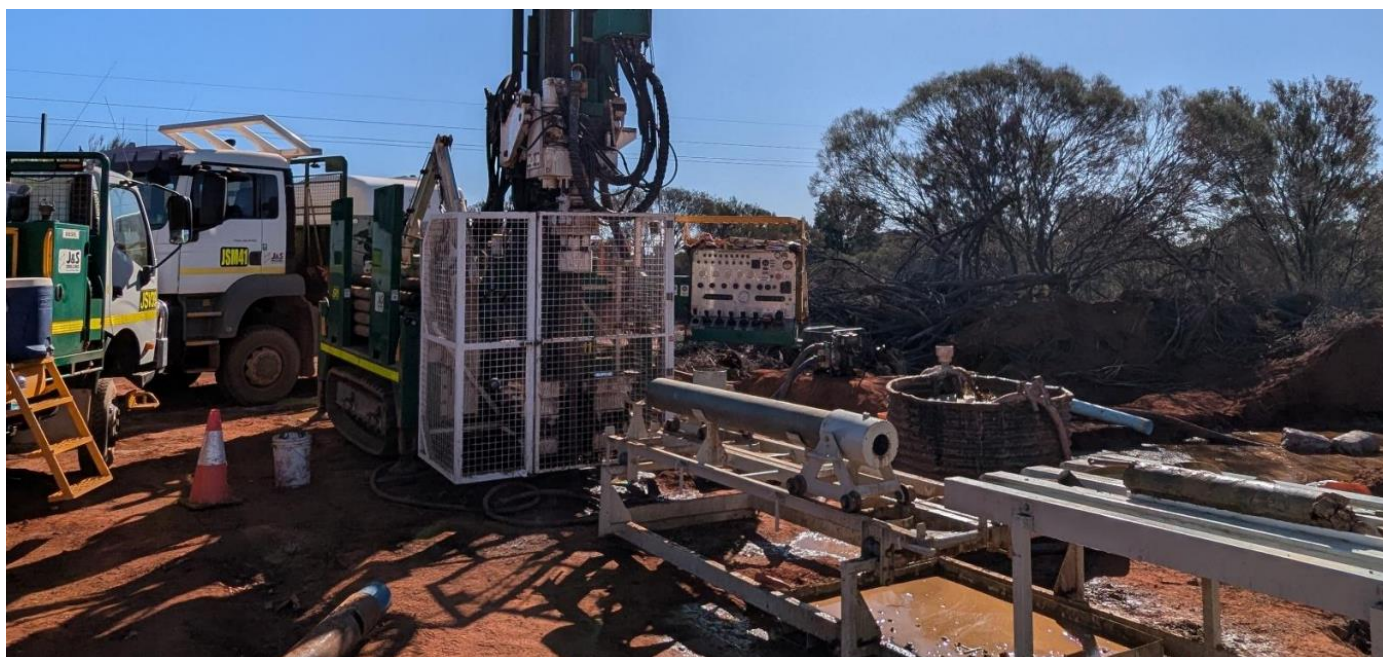
Figure 1: Large Diameter Drillhole underway at Goongarrie Hub. This drilling is being undertaken to source bulk samples for metallurgical testwork and no assay results are available.

Mineralised neutraliser samples for metallurgical testwork were selected from the remaining half core of the DD holes after assaying, utilising a combination of twin-hole RC assays, geological logging, and core photography to ensure a representative selection of lithologies and geochemical characteristics. One diamond drill rig remained on site at the end of May 2025, drilling large diameter drillholes for tripling of metallurgy DD and RC sample holes across Goongarrie South, Big Four / Scotia Dam, and Highway.